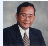
AMB. MAKARIM WIBISONO

Former European Commission Special Envoy for the Promotion of Freedom of Religion