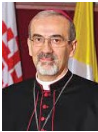
His Beatitude Pierre Battista Pizzaballa